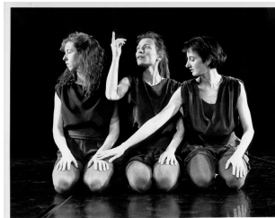
1. INTEMPCO, 1989. In Temporary Company